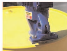
Cup plate mounting